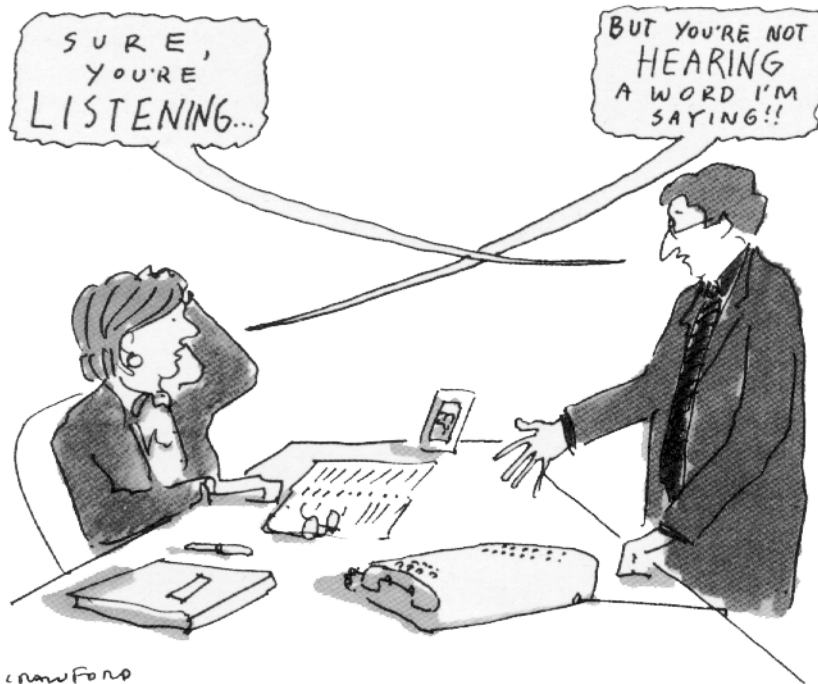
It's not enough to talk candidly. Professionals can still find themselves talking past each other.

Manager: "I agree. But professionals should take the initiative to educate the manager about the problems they are experiencing."